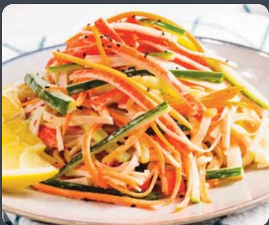
Kanikama Salad $8

(Crabmeat, Tobiko, Cucumber and Mayo Dressing)