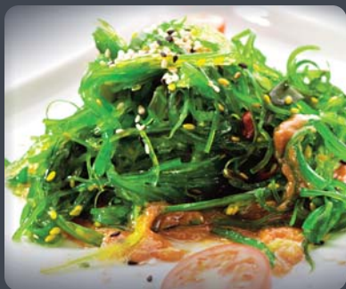
Seaweed Salad $6.5